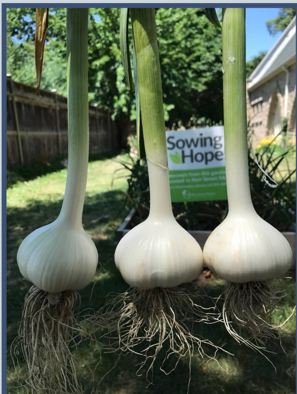
St Cuthbert's Garlic that would probably win prizes !