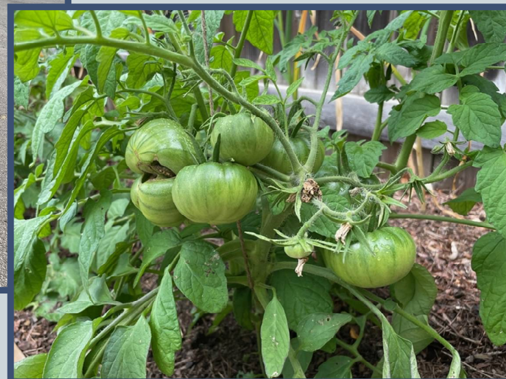
Our Tomatoes are coming on

Every thing we grow is donated to Kerr Street Mission, Fare Share Food Bank & Salvation Army. We did sell some garlic and the money raised will be used to fund the garden and the rest donated to the food charities. The garlic has been very well received at KSM. The last time we delivered, their customers were helping themselves before we could get it through the door!