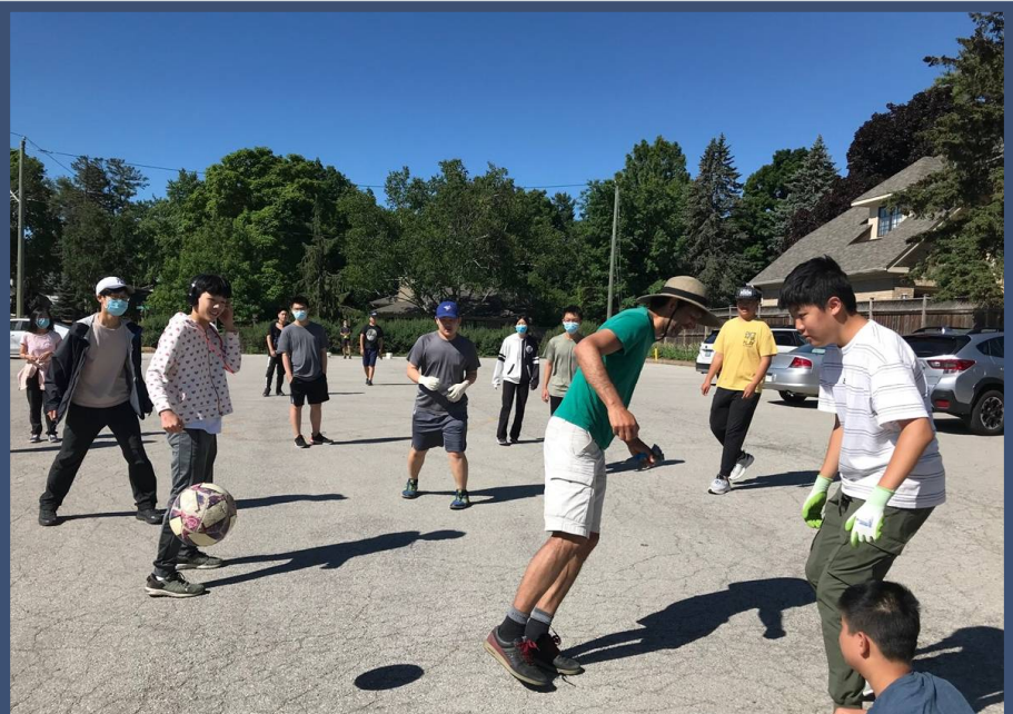
The youth played soccer after working on Saturday

On Saturday, July 9th the youth helped to clear all the debris from the old children playground and loaded up a bin in the car park. We had over 20 youth volunteers and so the job was finished in less than half an hour and the bin was fully loaded. We are expecting another bin and a Bobcat machine to come in August to clear the rest of the site so we can start planting the garden.